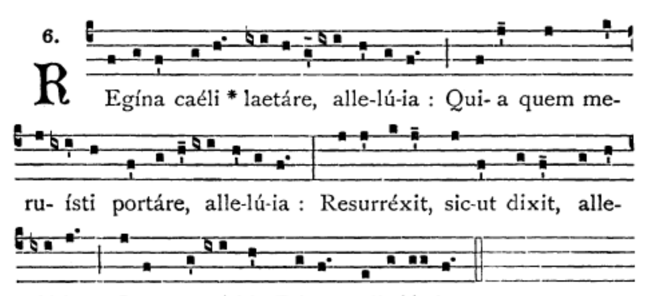
lú-ia : Ora pro nó-bis Dé-um, alle-lú- ia.

Joy fill your heart, O Queen most high, alleluia! Your Son who in the tomb did lie, alleluia! Has risen as he did prophesy, Alleluia! Pray of us, Mother, when we die, alleluia!