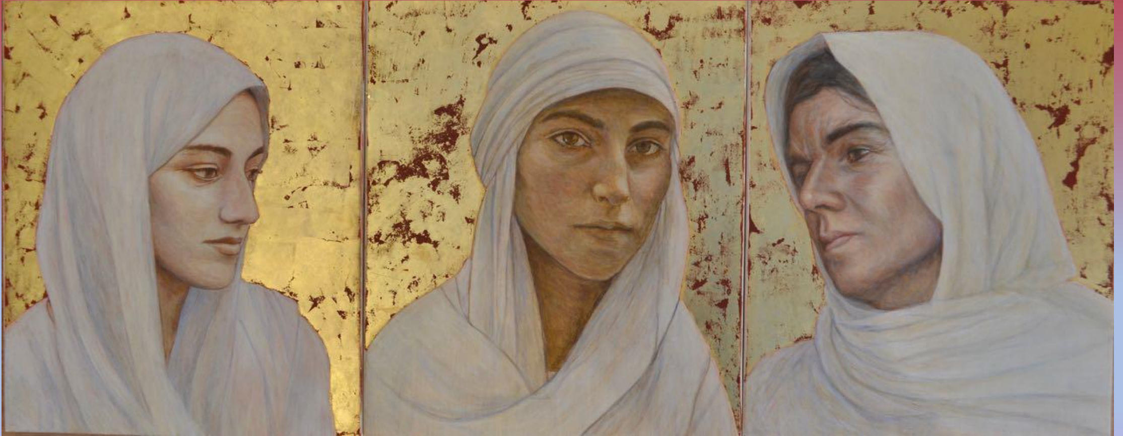
Triptych of Yezidi women who escaped ISIS captivity, by Hannah Rose Thomas (tempera and gold leaf on panel) ©

Let's make this message of 'love our neighbour' the way we all live our lives