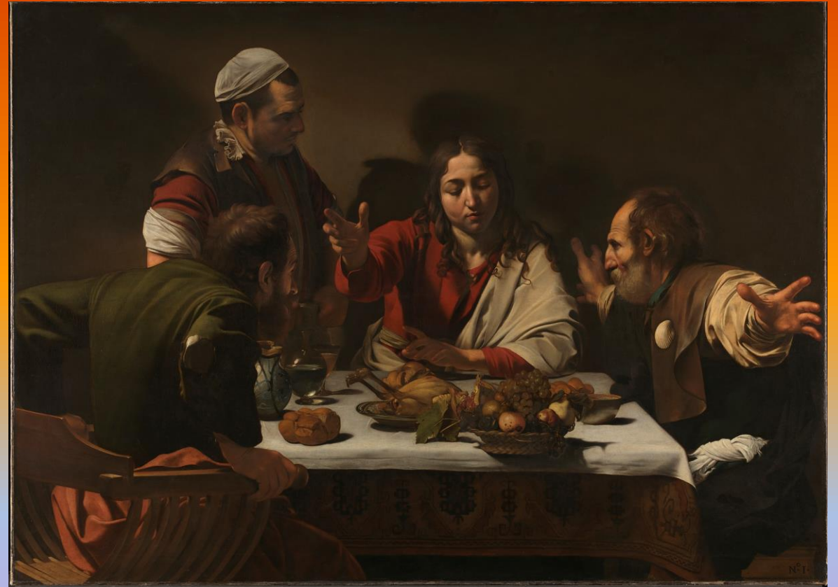
NG172: Michelangelo Merisi da Caravaggio The Supper at Emmaus , 1601